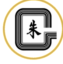
Gee Family Association of Houston